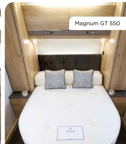
Magnum GT 550