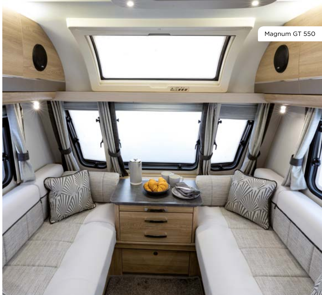
Magnum GT 550