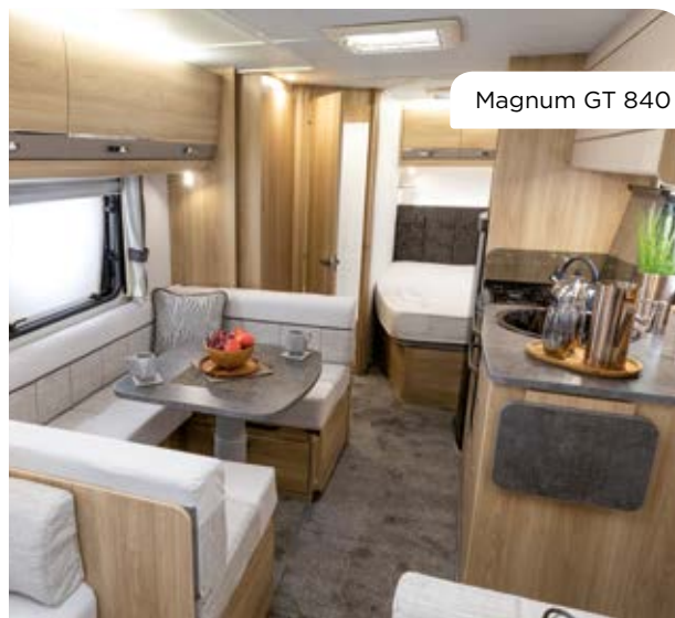
Magnum GT 840